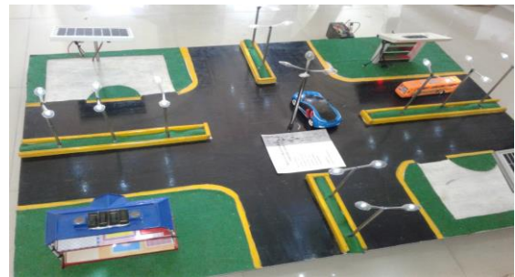
Fig.1: Solar charging station

Once set of batteries get discharged then old set of battery can be swapped with new charged batteries at charging station