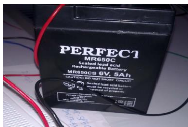
Fig. 4: Lead Acidic Battery

The team has selected two deep cycle batteries to power the system. Each battery is a 12V and has a 35 Amp-hour capacity. Batteries for PV system batteries generally have to discharge a smaller current for a longer period of time, such as at night or during a power outage, while being charged during the day. Deep cycle batteries are designed for the purpose of discharging to a lower capacity, between 50% and 80%, than a conventional battery. The most commonly used deep-cycle batteries are lead-acid batteries and nickel-cadmium batteries, both of which have pros and cons. The deep-cycle batteries are able to be easily charged and discharged many times and can last for several years due to the thicker plate materials utilized. Batteries in PV systems can also be very dangerous because of the energy they store and the acidic electrolytes they contain,